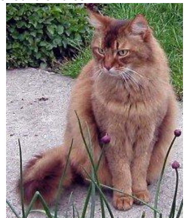
SLH Somali 63L